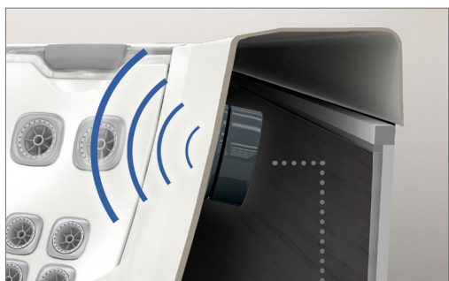
Speaker mounted within spa shell